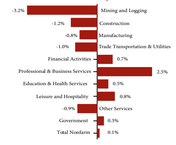
Figure 2 Mixed Success for First Quarter 2012